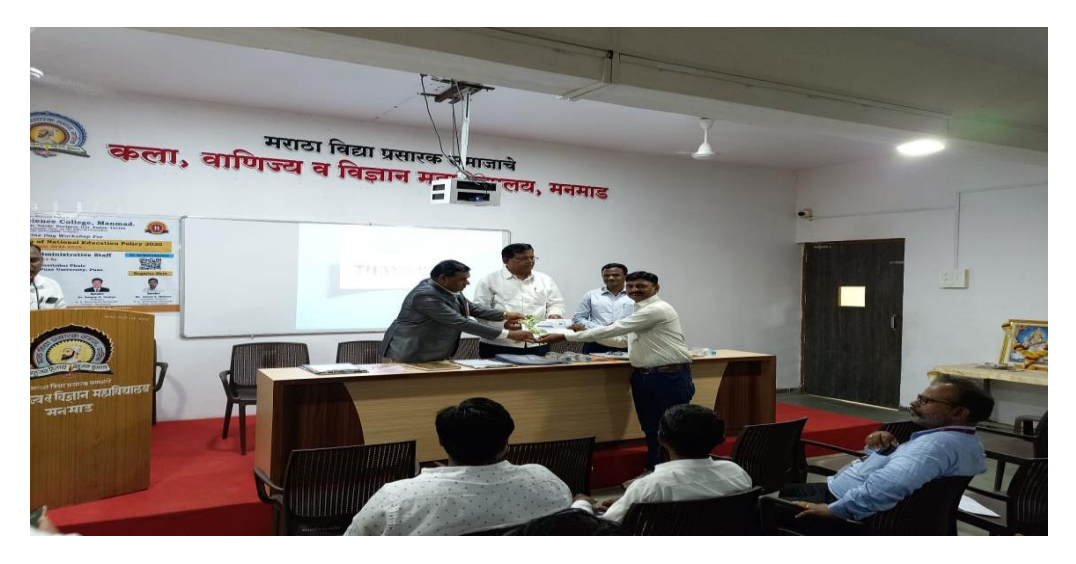
Certificate Distribution to the participants