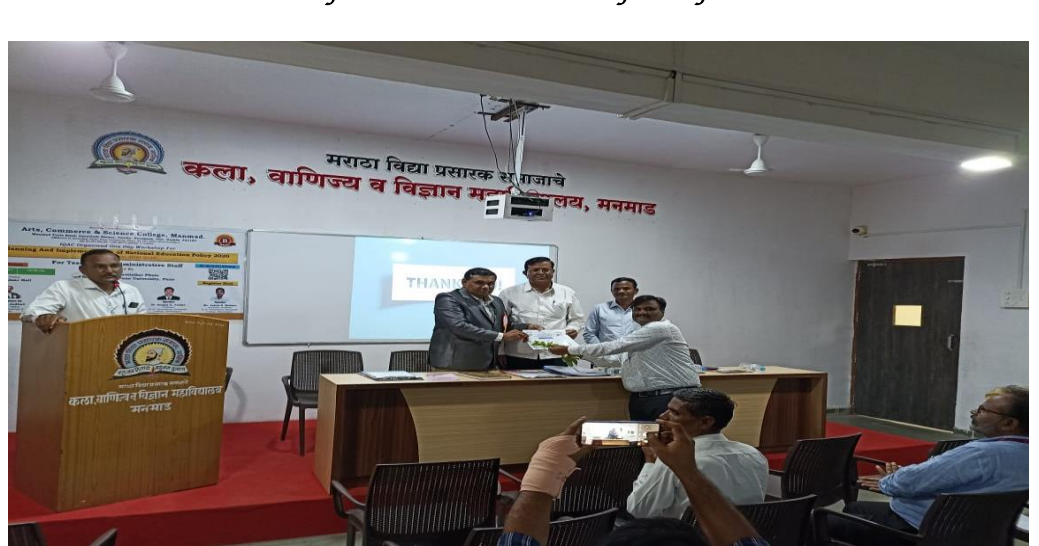
Certificate Distribution to the participants