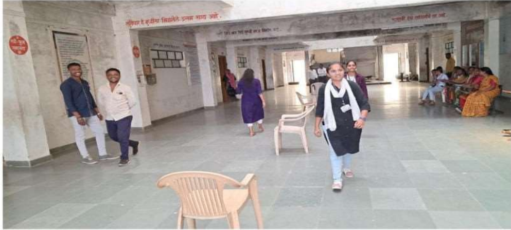
Students are participated Music Chair Competition.