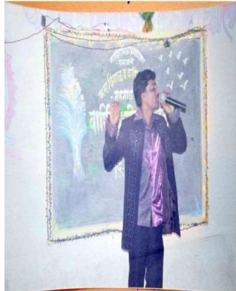
Students Celebrating The Youth Festival by Various Presentations, and Competitions.