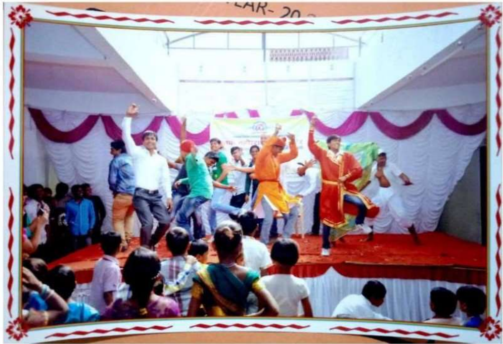
Students Performing On the Occasion.