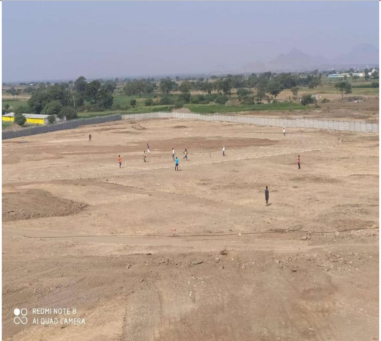
Playing Cricket competition at a Glance