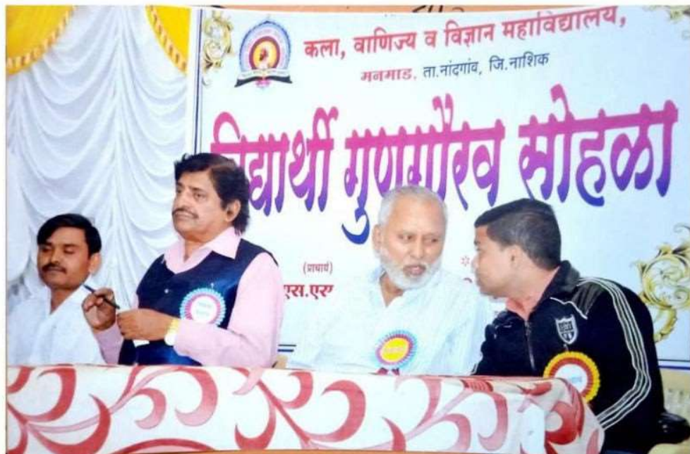
College Staff & Guest Participant in the Occassion.