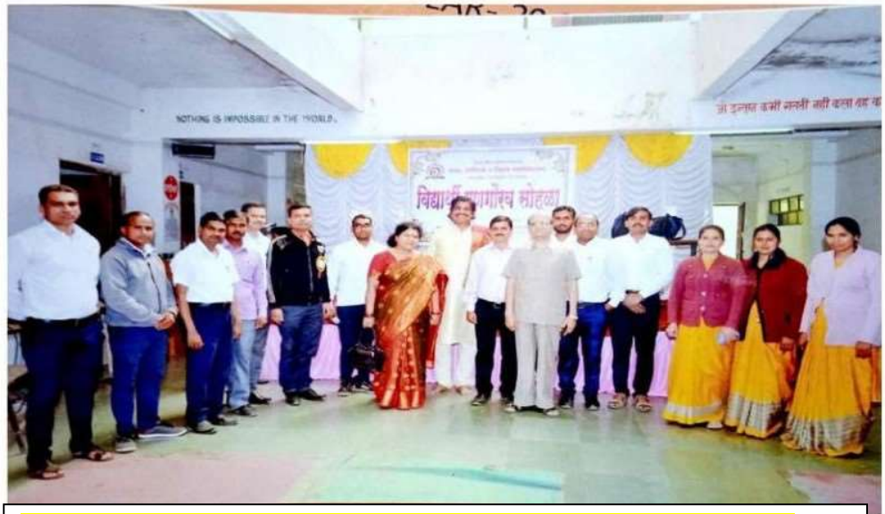
Hn'ble Dignities, Principal College Staff are present college function.