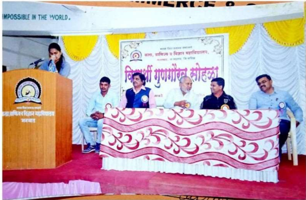
Students Expressing their experiences and views