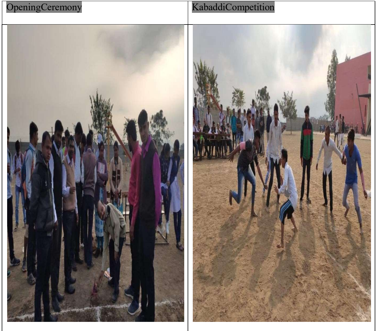
Students are participated Cricket and kabaddi Competition.