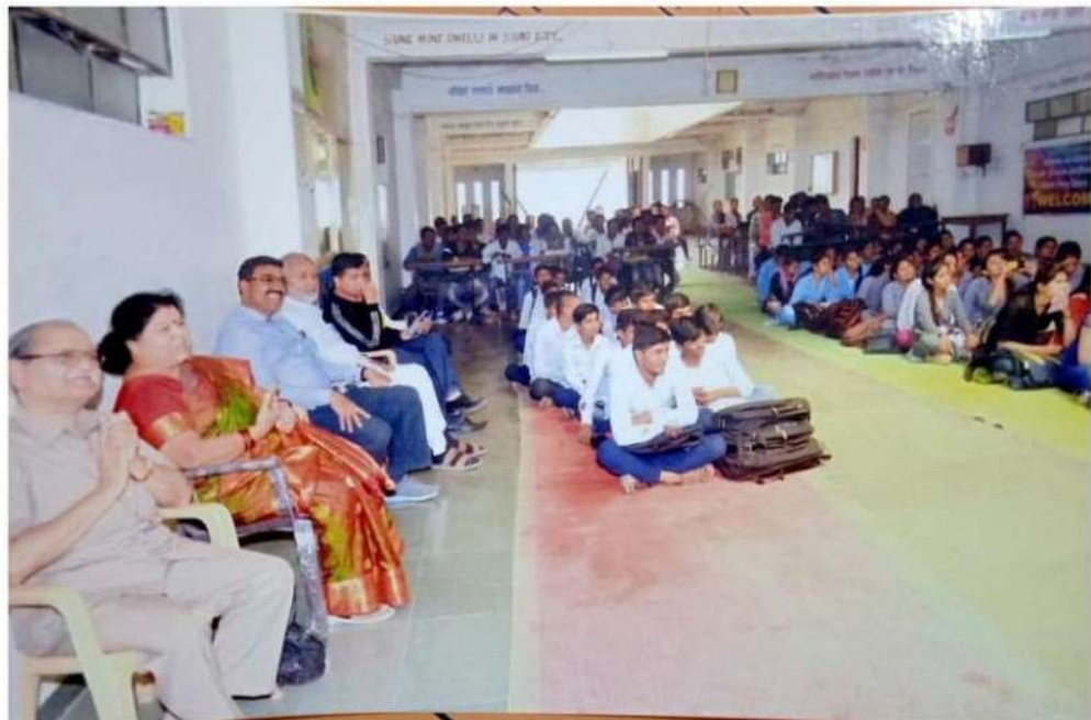
Participants viewing and enjoying

Students are Participated Annual Gathering Programme.