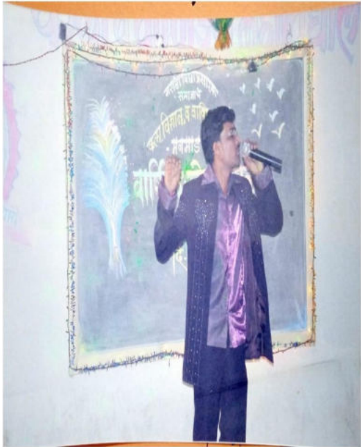
Students Celebrating The Youth Festival by Various Presentations, and Competitions.