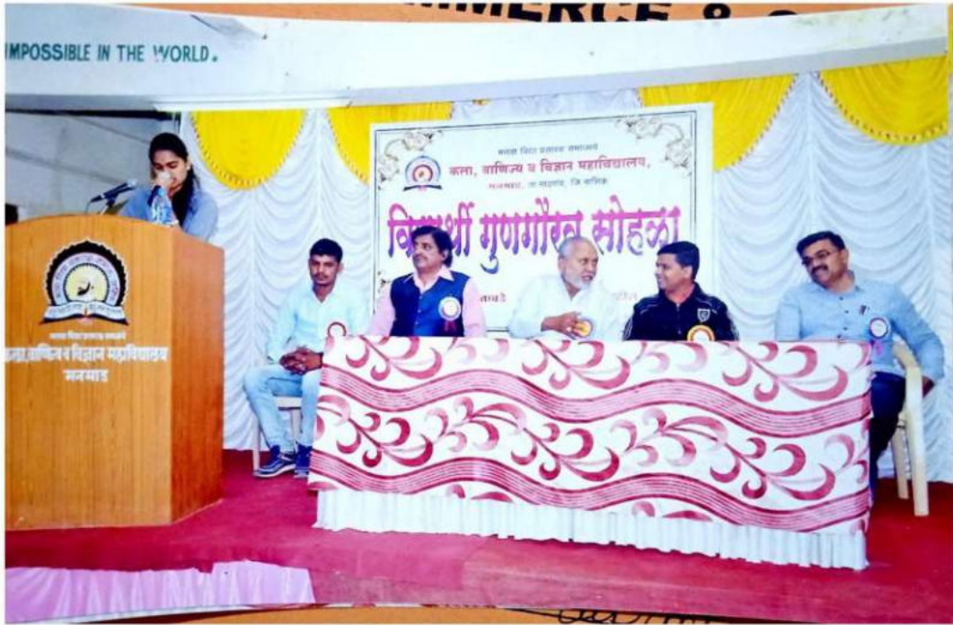
Students Expressing their experiences and views