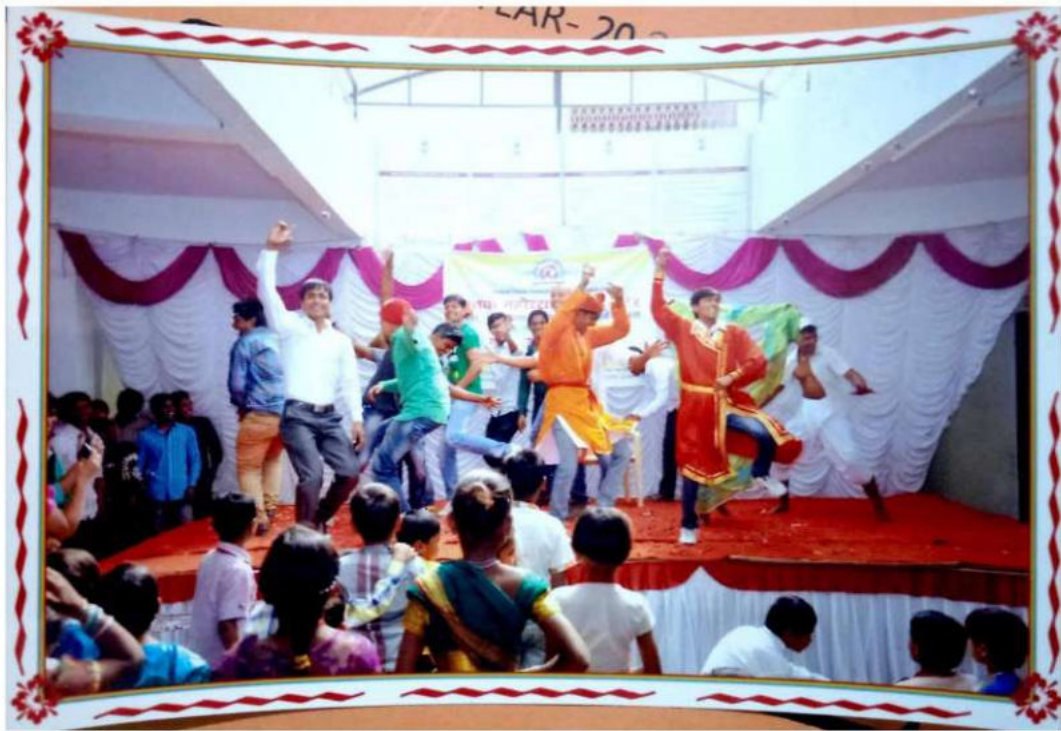
Students Performing On the Occasion.