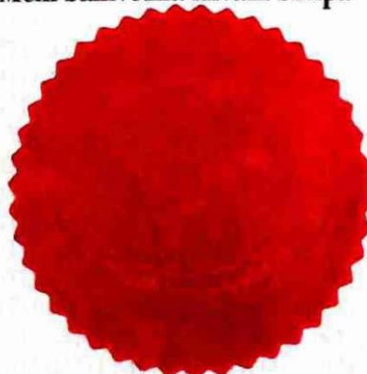
Vice-Chancellor/President कुलपति / अध्यक्ष