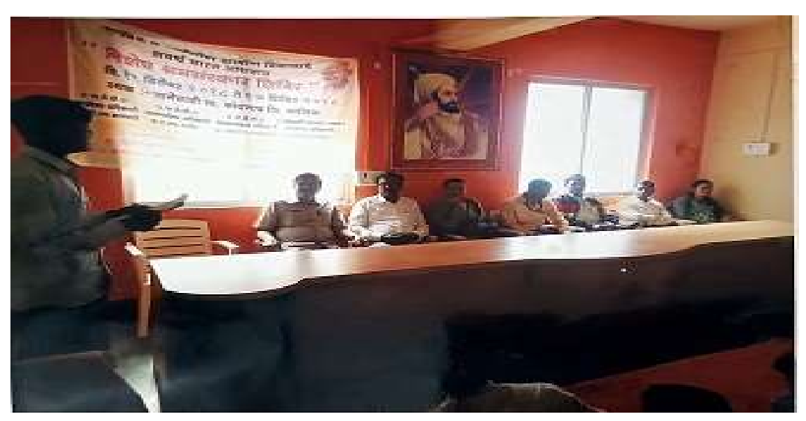
NSS Winter Camp inauguration function