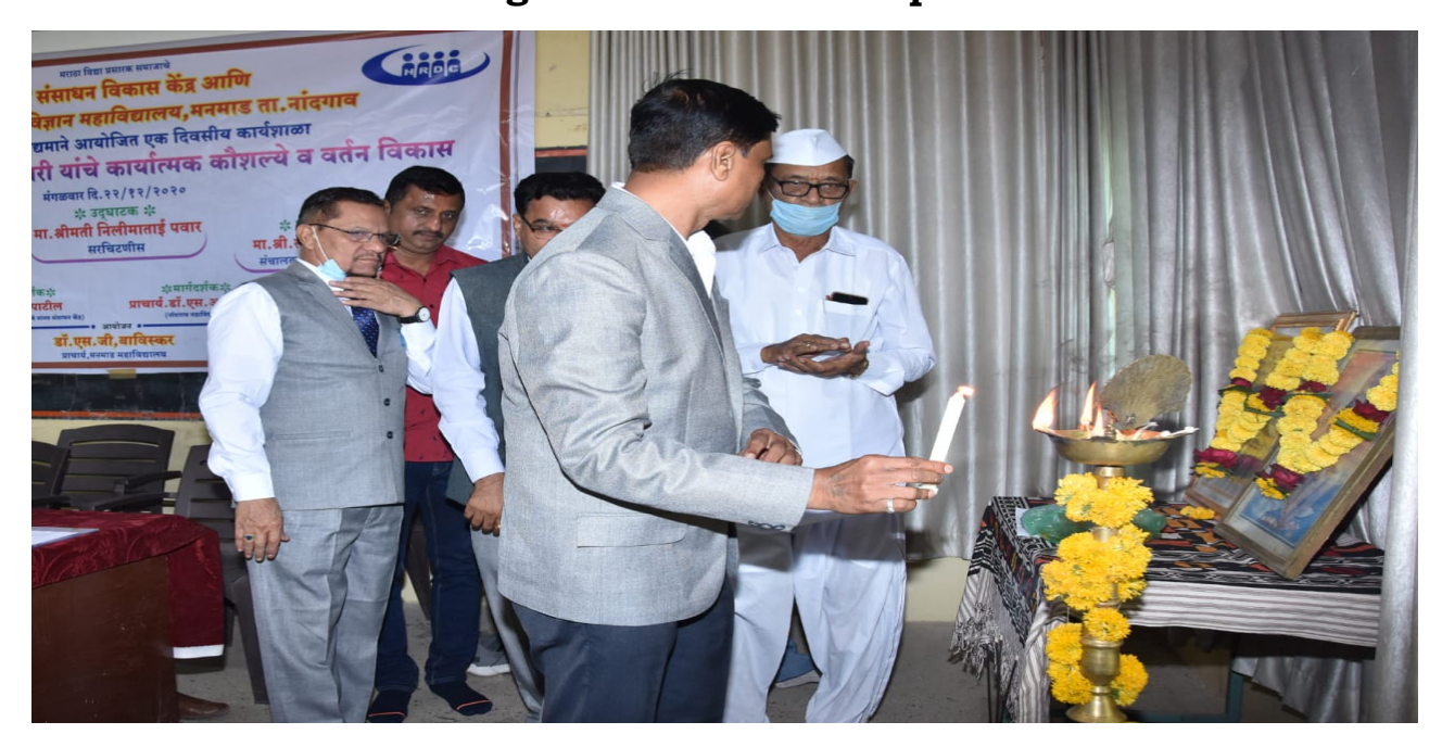
Felicitation of Guests